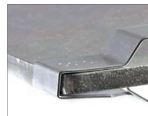
Secure grip on metal sheets due to mounting claws